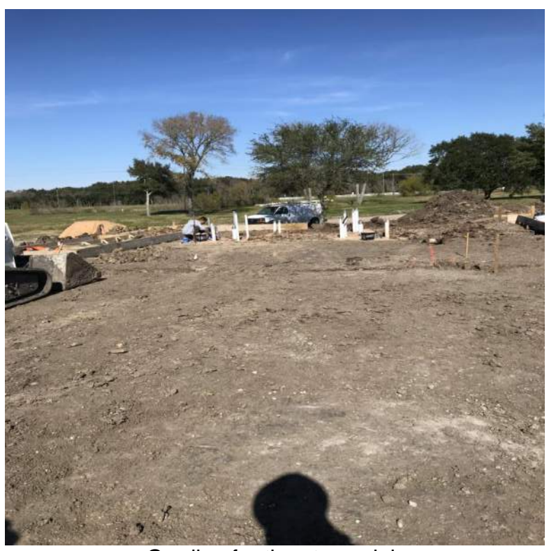
Grading for the stage slab