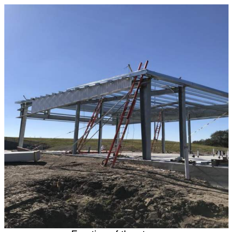
Erection of the stage