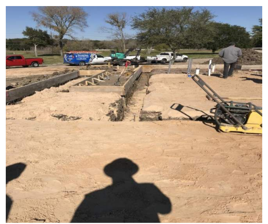
Grade beams for stage.