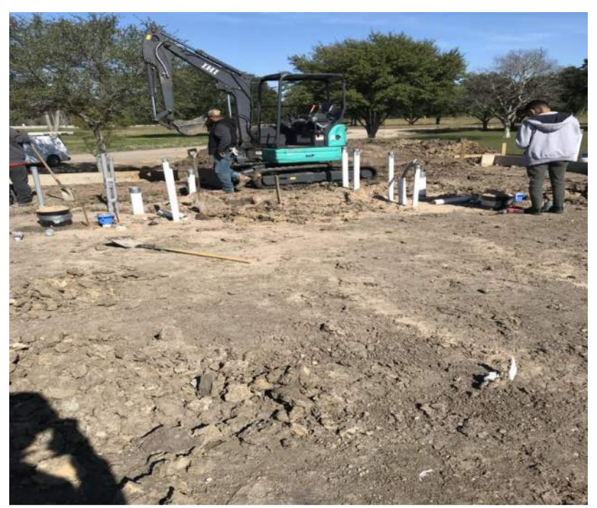
Stage Slab plumbing and electrical rough-in