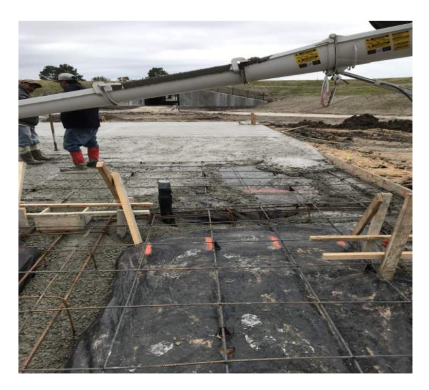
Stage slab pour