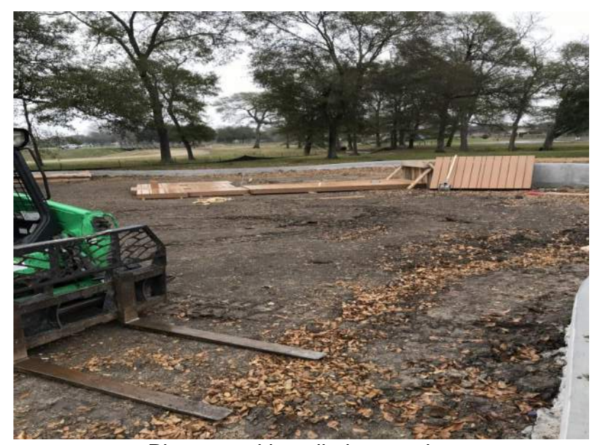
Playground installation starting