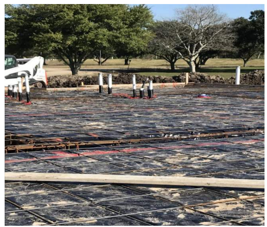
Vapor barrier and rebar installed