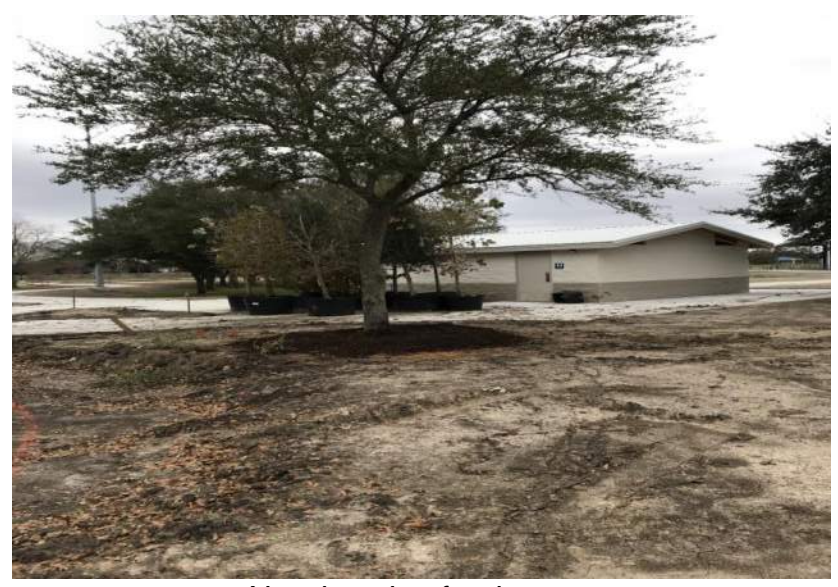
New location for the tree