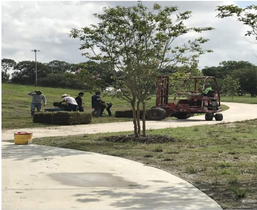
Sod installation of the Berm.