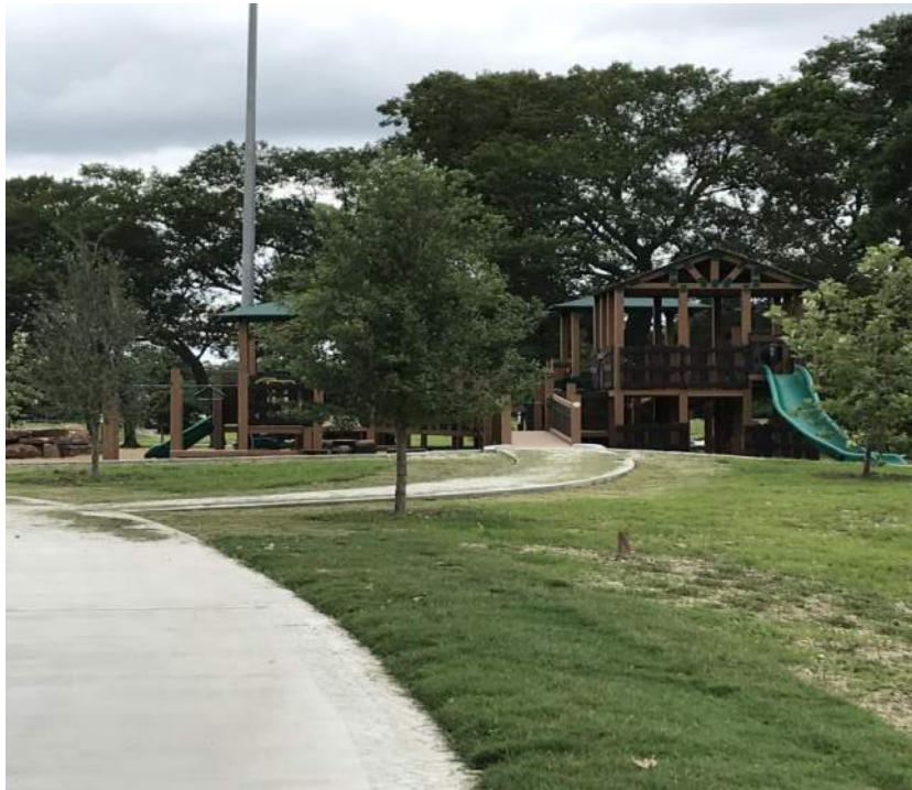
Playground Installation Complete