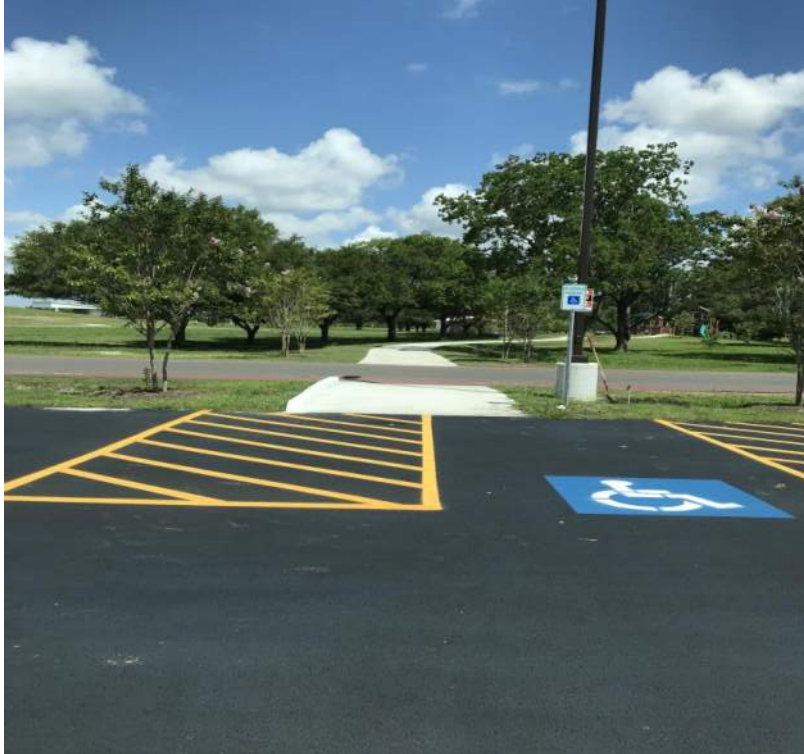
New Parking lot Striping