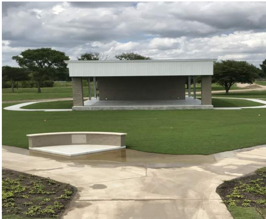
Stage area is finished