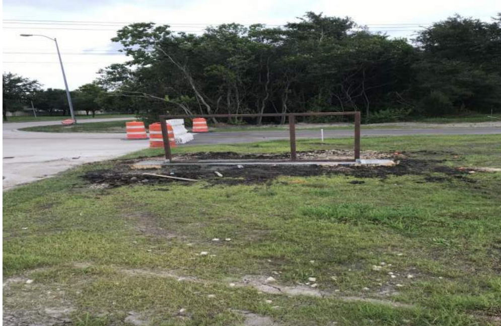
Monument entrance sign