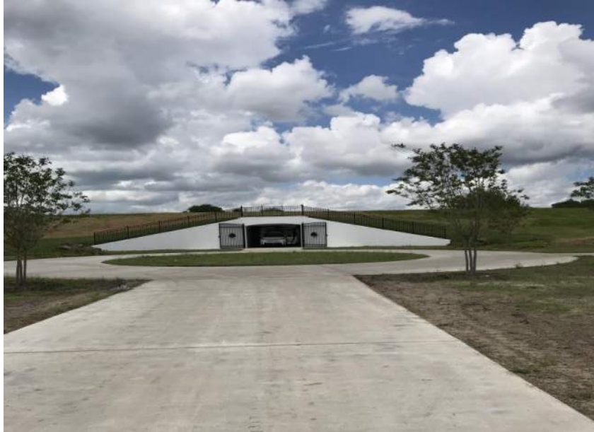
Plaza tunnel entrance